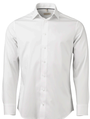
OM01 slim. Size 37/38 – 45/46