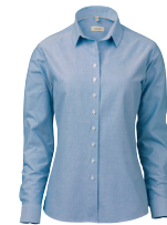
OM05 slim. Size 32-44