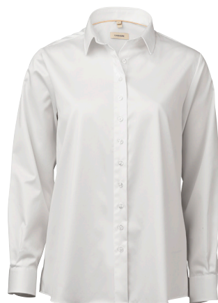
OM01 loose. Size 36-54