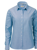
OM05 comfort. Size 36-54