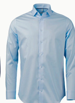
OM10 lt blue