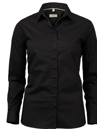
OM07 comfort. Size 36-54