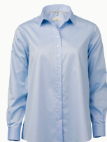
OM02 loose. Size 36-54