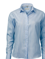
OM06 comfort. Size 36-54