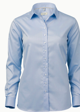
OM02 comfort. Size 36-54