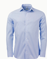
OM04 slim. Size 37/38 – 45/46