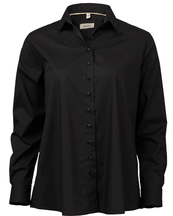
OM07 loose. Size 36-54