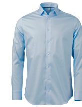
OM10 lt blue