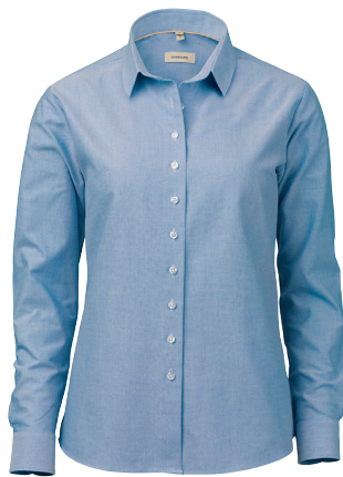
OM05 comfort. Size 36-54