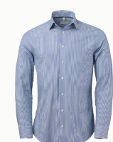
OM03 slim. Size 37/38 – 45/46