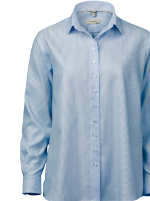
OM06 loose. Size 36-54