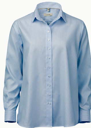
OM06 loose. Size 36-54