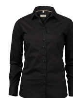
OM07 comfort. Size 36-54