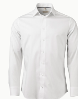
OM01 slim. Size 37/38 – 45/46