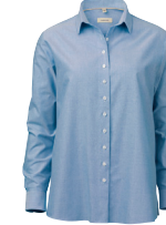
OM05 loose. Size 36-54

OM06 Light blue/White striped stretch oxford