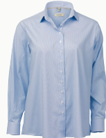
OM04 loose. Size 36-54