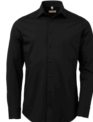
OM07 slim. Size 37/38 – 45/46