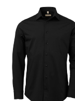
OM07 slim. Size 37/38 – 45/46