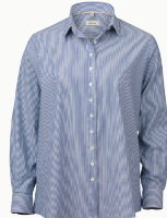
OM03 loose. Size 36-54