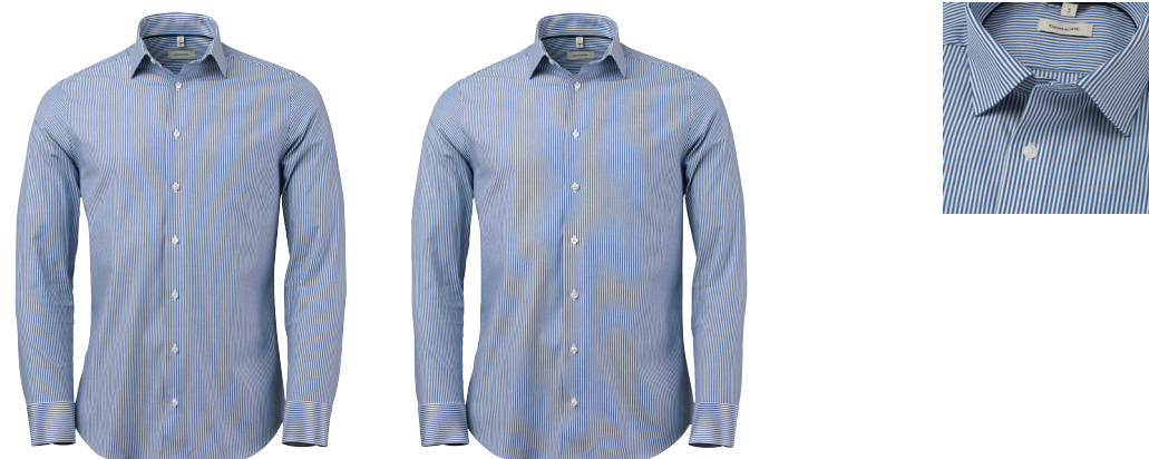
OM03 slim. Size 37/38 – 45/46