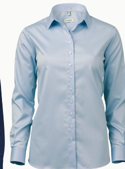
OM10 lt blue