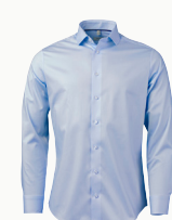
OM02 slim. Size 37/38 – 45/46