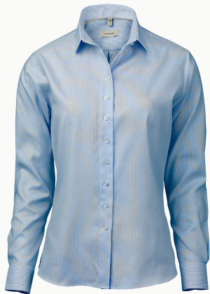
OM06 slim. Size 32-44