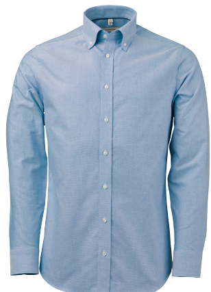
OM05 slim. Size 37/38 – 45/46