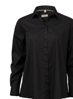
OM07 loose. Size 36-54