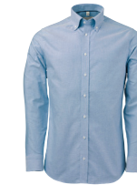
OM05 slim. Size 37/38 – 45/46