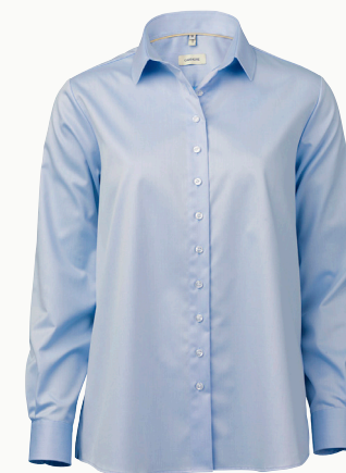
OM02 loose. Size 36-54