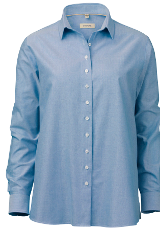
OM05 loose. Size 36-54