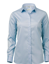
OM10 lt blue