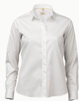
OM01 comfort. Size 36-54