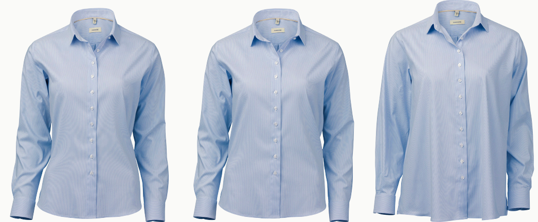
OM04 slim. Size 32-44