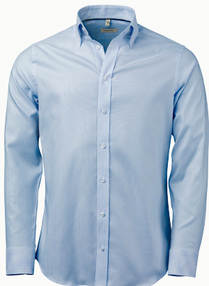
OM06 slim. Size 37/38 – 45/46