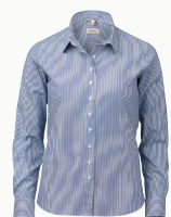
OM03 comfort. Size 36-54