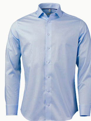
OM02 slim. Size 37/38 – 45/46