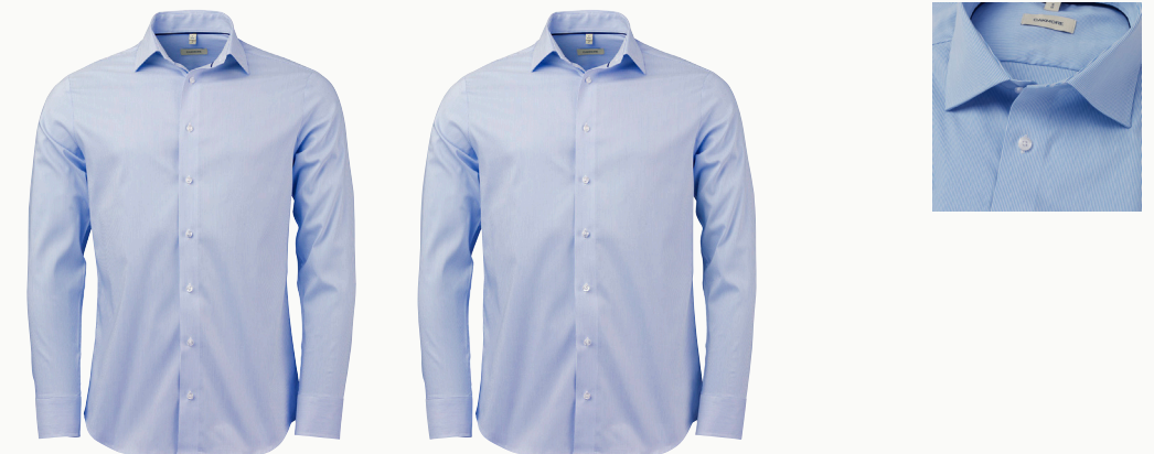
OM04 slim. Size 37/38 – 45/46