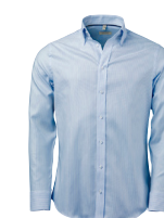
OM06 slim. Size 37/38 – 45/46