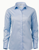
OM02 comfort. Size 36-54