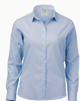
OM04 comfort. Size 36-54