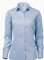
OM02 slim. Size 32-44