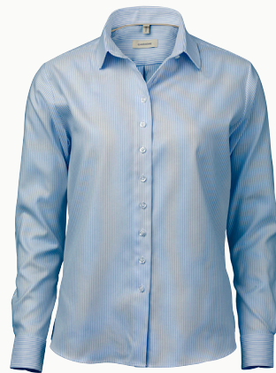
OM06 comfort. Size 36-54