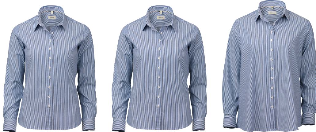
OM03 slim. Size 32-44