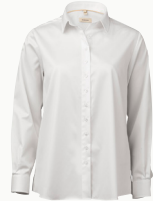
OM01 loose. Size 36-54