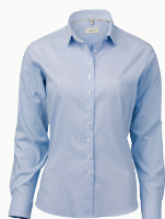
OM04 slim. Size 32-44

OM04 Light blue/White striped fine oxford