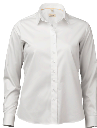
OM01 comfort. Size 36-54